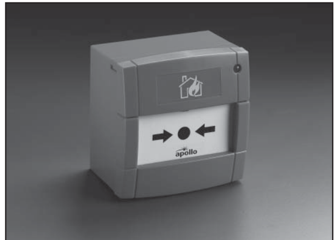
Part nos. 55100-021MAR (Marine Indoor - Red) 55100-022MAR (Marine Outdoor - Red)

The Manual Call Point consists of a 470Ω resistor in series with a normally open switch contact.