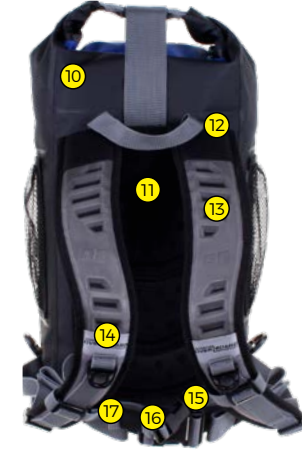
As used by Bear Grylls