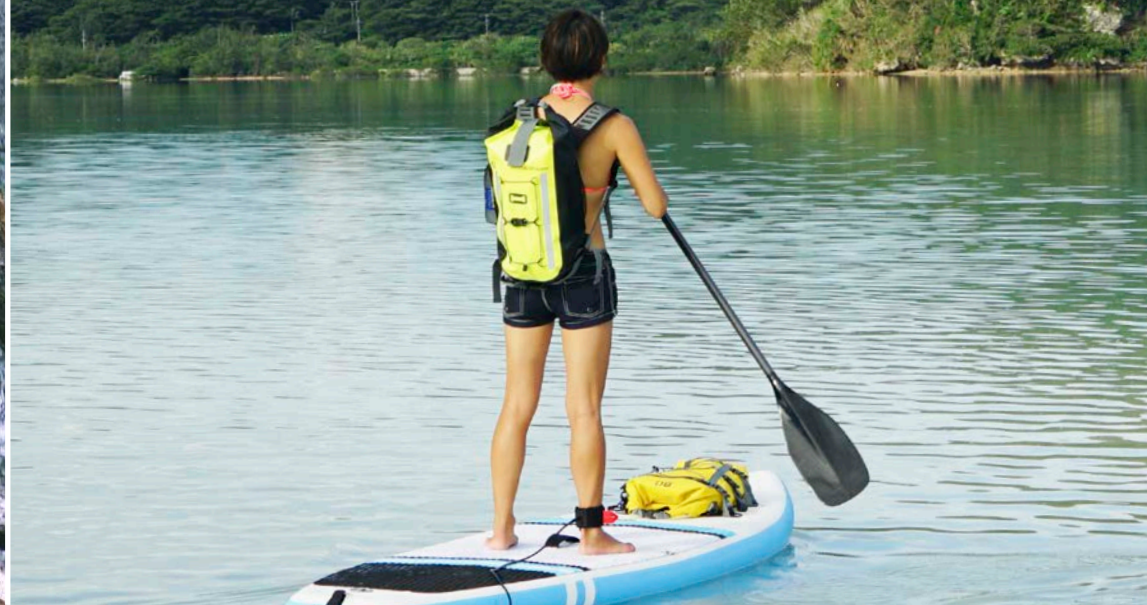
As used by Julia Bradbury