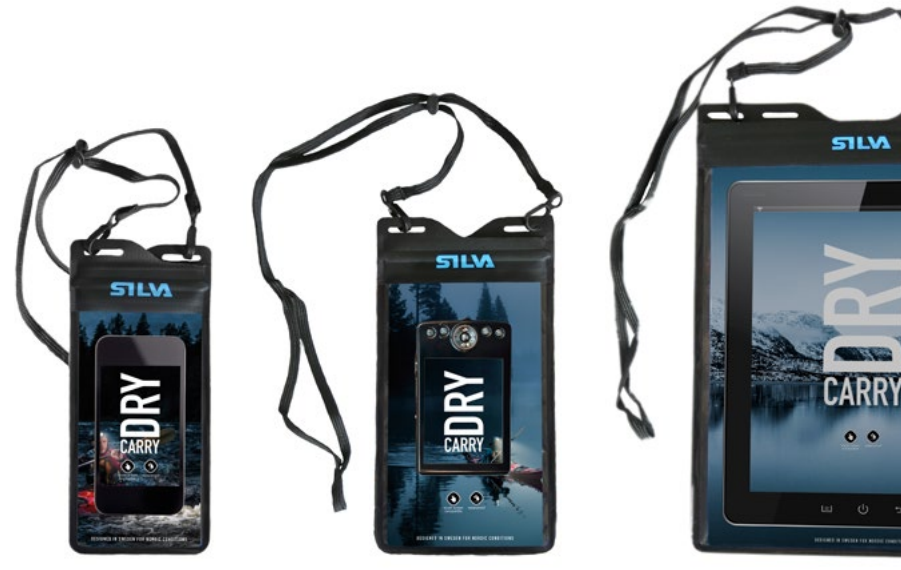
Art.No: S 39009-2

A range of cases that protect valuable belongings, such as smart phone, camera, GPS or tablet, from water, snow, sand and dust. They are fully touch screen compatible and the transparent front and rear make it possible to use the camera function without taking the electronics out of the case. The cases feature an enclosed neck strap to keep hands free and a zipper enables swift handling. Available